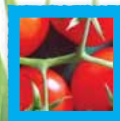
Perfect for tomatoes & veggies

See what's in full bloom at www.bradfieldorganics.com