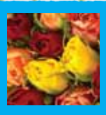
Perfect for all types of roses