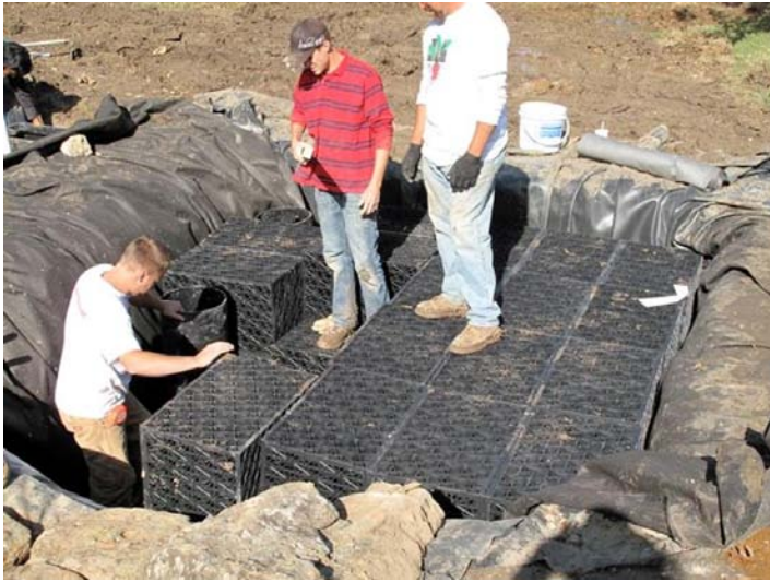
building retention pond