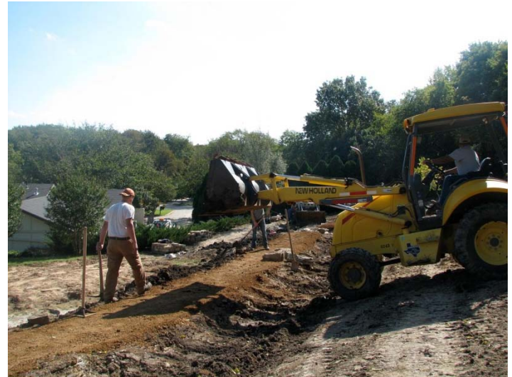
passive water earth work