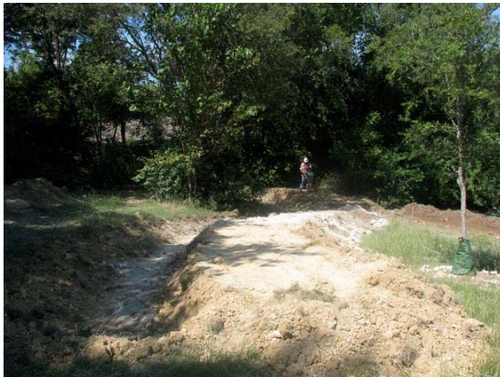
empty swale and path being created