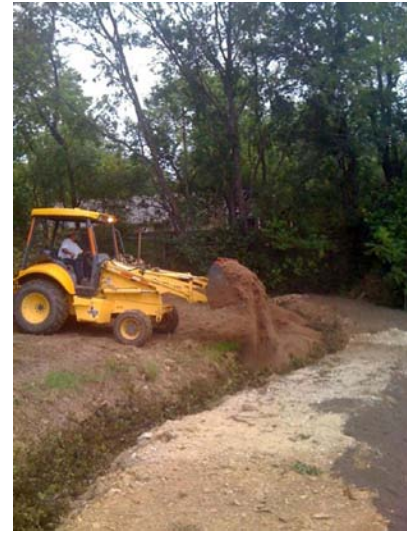
topping off swale