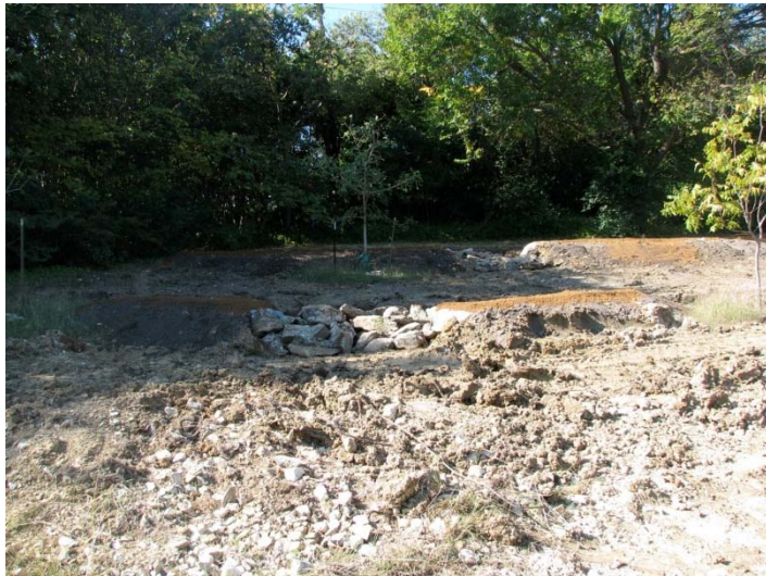
overflow dams on small berms