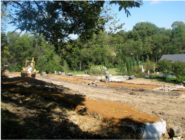
prepared earth terrace