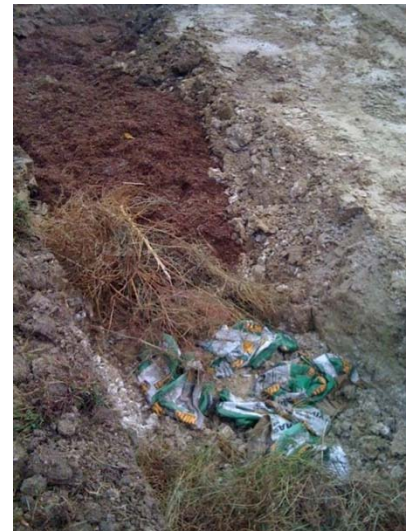
swale takes all